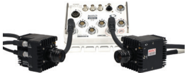
Miro C321 / C321J Connectors With the Miro Junction Box 2.0